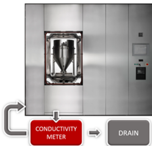
Figure 4 - Schematic view of the online application of conductivity sensors in Fedegari steam washers.