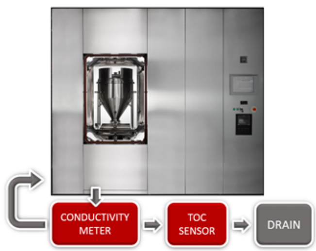
Figure 5 - Schematic view of the online application of conductivity and Total Organic Carbon sensors in Fedegari washing machines.

This case study regards the online application of the conductivity and Total Organic Carbon sensors in Fedegari steam washers. In these machines, both the conductivity meter and the TOC analyzer are integrated in the hydraulic system and connected to the process controller (see Figure 5).