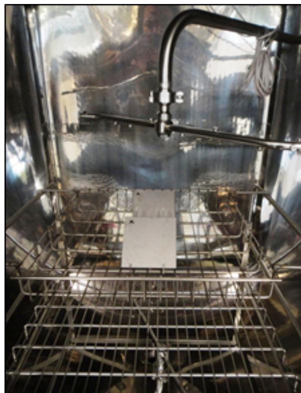
Figure 1 - Stainless steel coupons placed on special supports inside the washing machine

In addition, an appropriate cleaning equipment, composed of rotating arms with nozzles, was designed and built. Since the effectiveness of the process in terms of the intended goal was not known, a standard cycle already applied at a