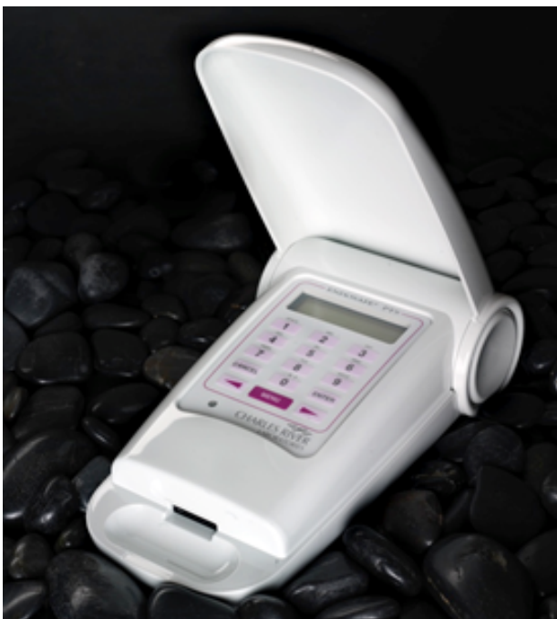
Figure 2 – Endosafe PTS instrument, manufactured by Charles River, used for the evaluation of the endotoxin load of the samples being considered.

The instrument used (see Figure 2), Endosafe PTS (Charles River), is a portable cartridge spectrophotometer, which measures the endotoxin content as a function of the time required to develop a given quantity of color. The higher is the endotoxin content; the lower is the response time.